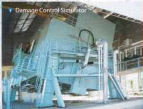
▲ Damage Control Simulator

Sail Training Ship GSL has built the first ever Sail Training Ship meant for training cadets. This ship "INS Tarangini" has successfully completed the circumnavigation voyage around the world on a mission of bridging friendship across the oceans. The ship has eighteen sails with a sail area of about 1000 sq m with very high endurance and can be deployed at sea continuously for a period of twenty days. Sail Training Ships are increasingly being used as basic seamanship and character building platforms by Navies the world over.