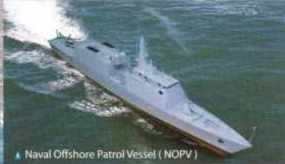
Naval Offshore Patrol Vessel ( NOPV )