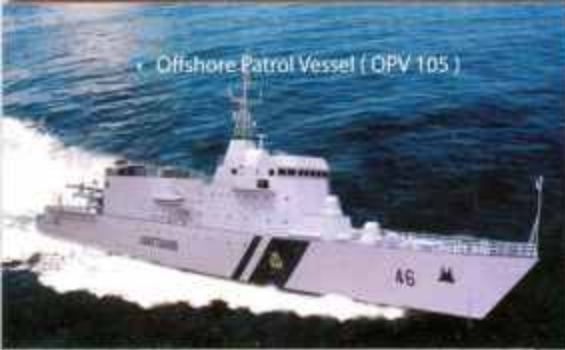
Offshore Patrol Vessel ( OPV 105 )