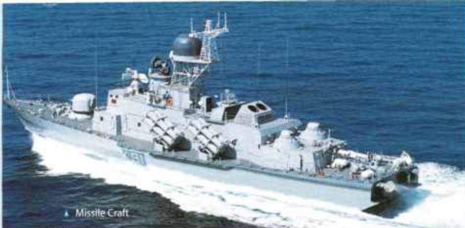
▲ Missile Craft