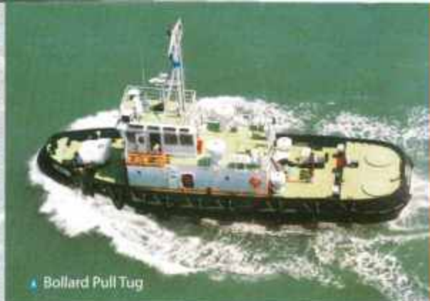
▲ Bollard Pull Tug