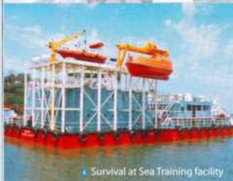
▲ Survival at Sea Training facility