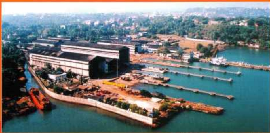
▲ Bird's Eye View of Goa Shipyard Limited