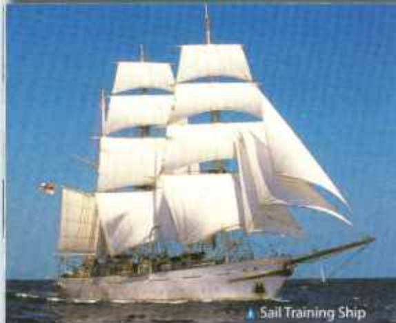
▲ Sail Training Ship