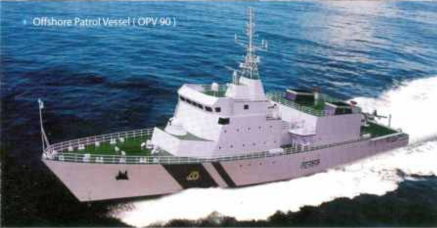
Offshore Patrol Vessel ( OPV 90 )